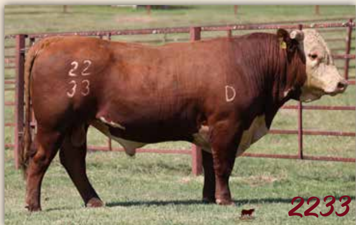
At the farm, Horton, Alabama