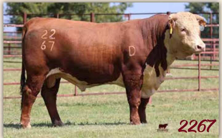
At the farm, Horton, Alabama